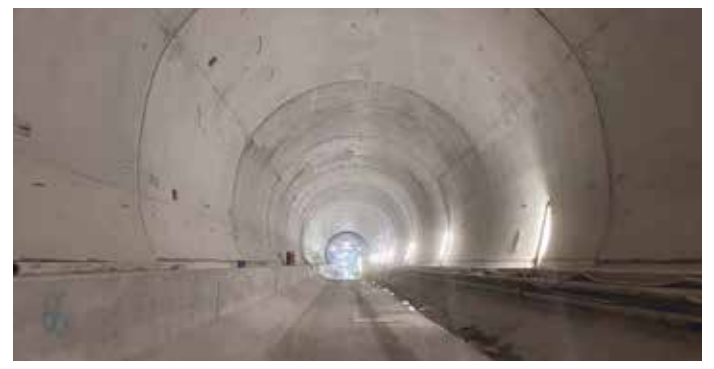
At 860 m long, the Brandberg Tunnel is the key structure on the Oberwinden bypass.