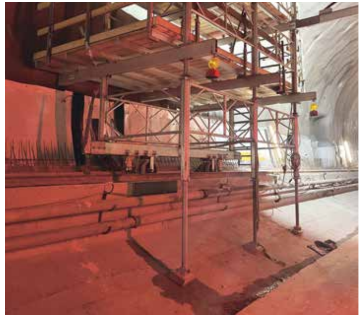
Swivel base plates were fitted underneath the TITAN adjustable legs to compensate for the angle of the base of the tunnel.