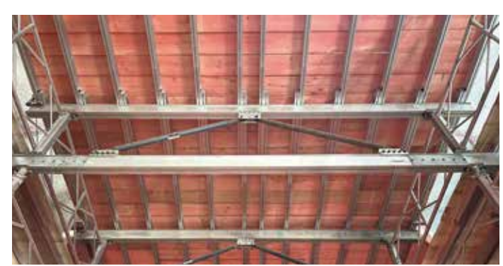
TITAN push-pull props distribute the horizontal loads acting on the topmost platform.