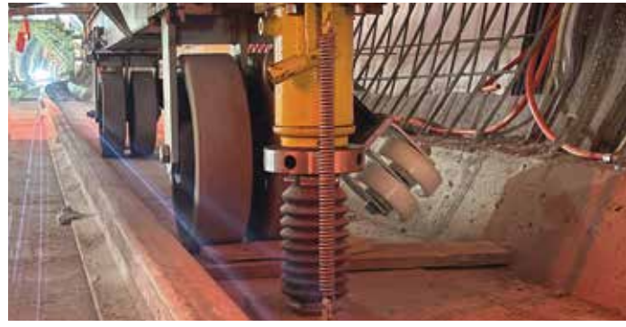
Fixed castors and hydraulic jacks were fitted to make the whole TITAN Megashore scaffold mobile.